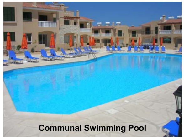
Communal Swimming Pool